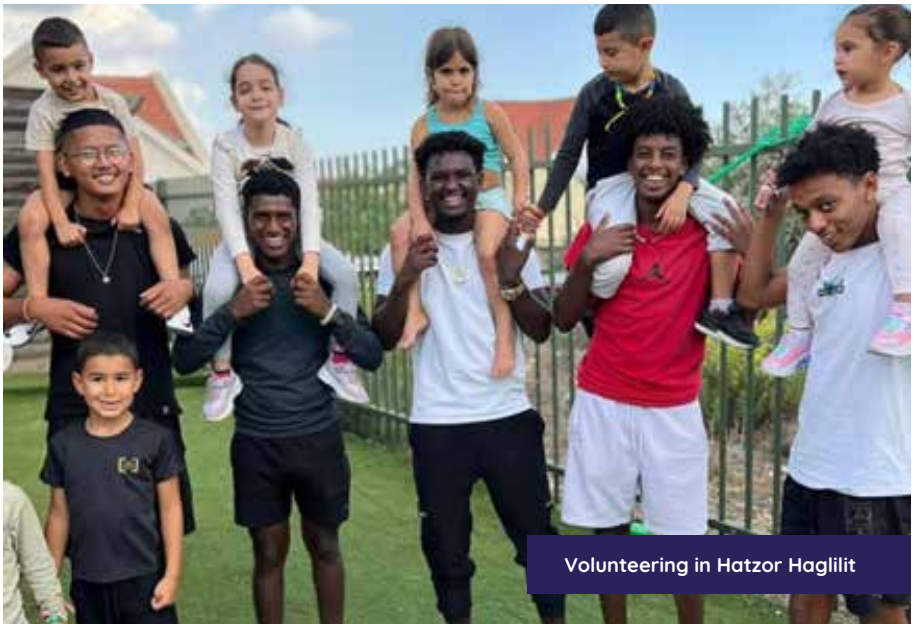
Volunteering in Hatzor Haglilit